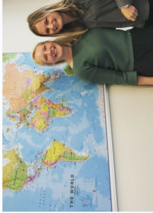
The updated RSV GOLD world map where we collected cases in 36 countries!

If you have any questions about this project or if you are interested and willing to share data with us, please do not hesitate to contact us.